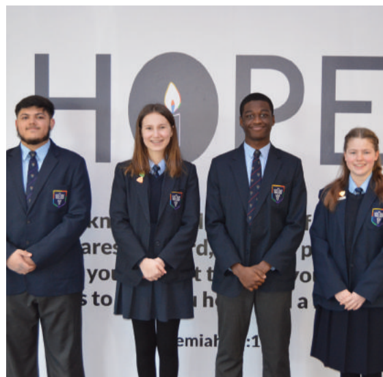
Our Head Boy and Girl Team for 2021/22