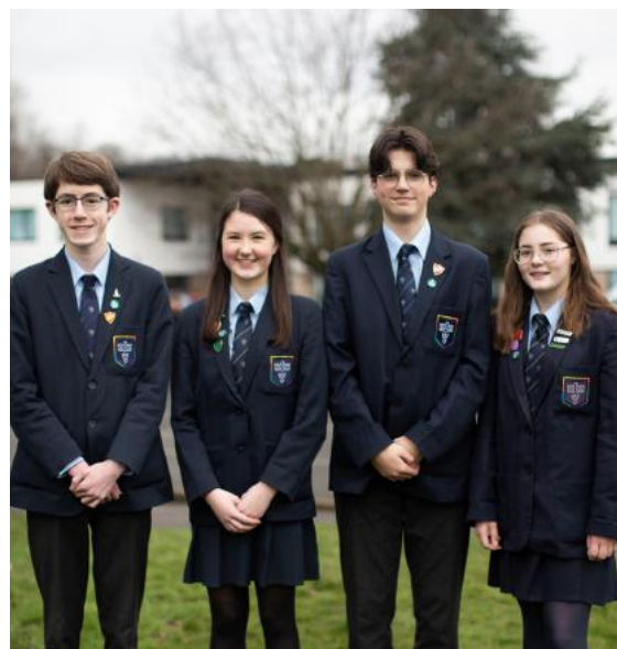
Our Head Boy and Girl Team for 2020/21